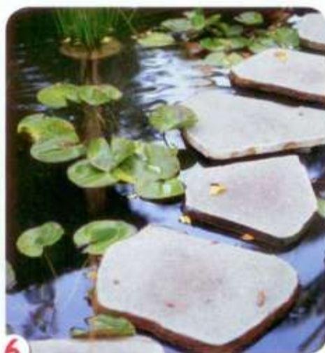
6 Pathways encourage interaction with green spaces, setting up a sense of anticipation and adventure.