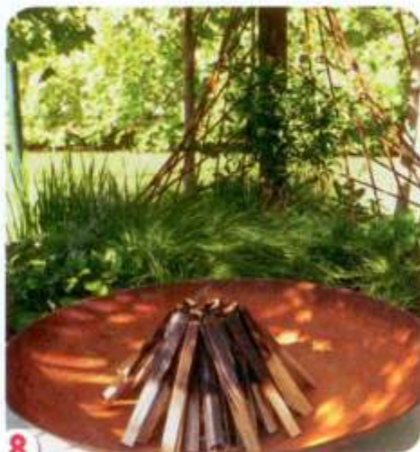
8 Add drama to your backyard with a fire pit. Daniel Tyrrell's award-winning design centred around an oversized fire.