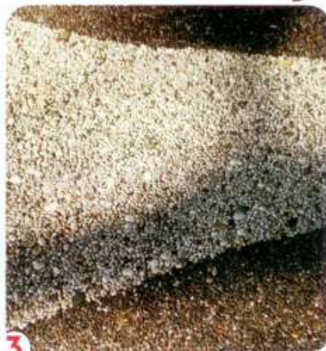
3 Veering away from large statement pieces, many designers turned to contrasting tones, like these two-toned pebbles, for impact.