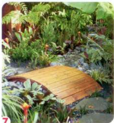
7 Lush tropical plantings offer up a vibrant display of texture and, teamed with paths and bridges, form an exotic oasis.