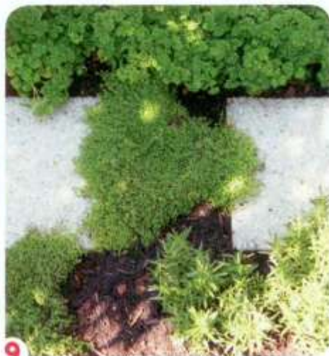
9 Practical thinking! Herbs are used as delightful groundcover, softening the edges of recycled glass pavers.