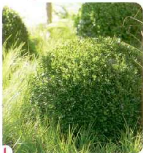
1 Garden designer Daniel Tyrrell displayed prim sculptured Buxus Sempervirens hedges in a sea of soft grasses.