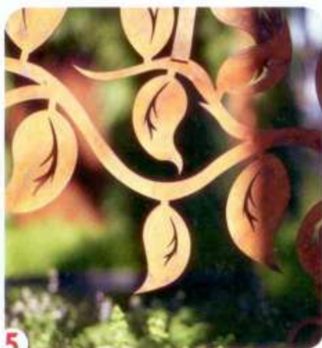
5 A mix of materials like this Corten-steel screen in organic shapes and tones creates a stunning juxtaposition in any garden.